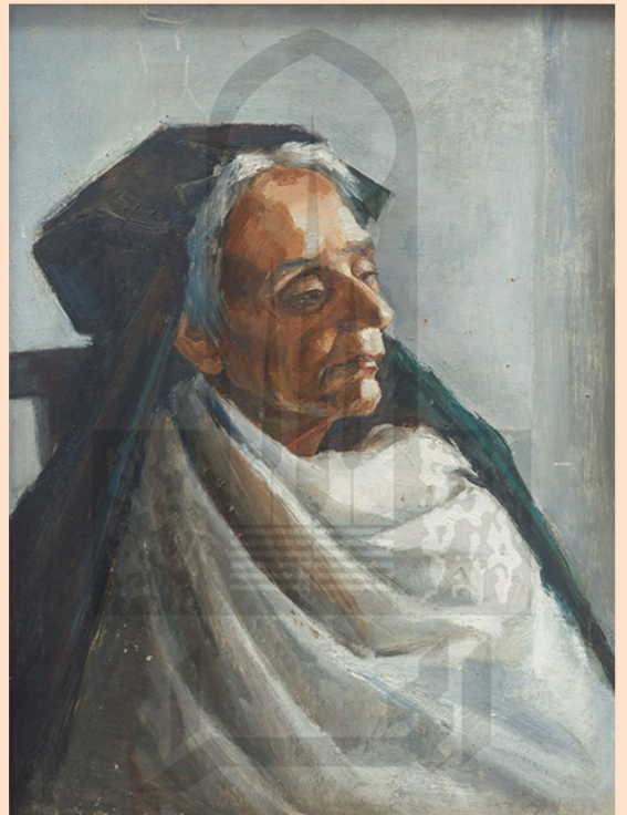
'Fallen Letter' Oil on Board 90 x 123 cm 1978