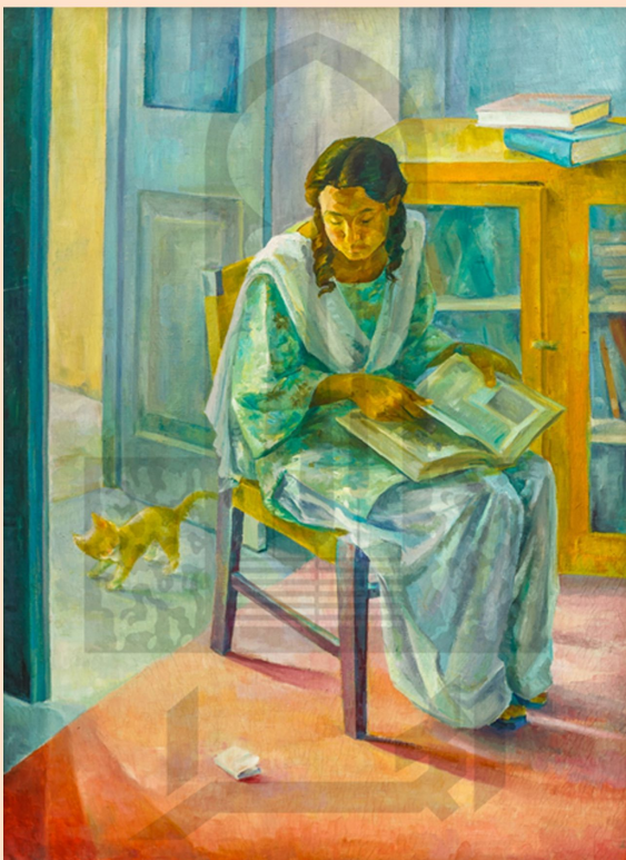
'Window Still' Oil on Board 90 x 60 cm