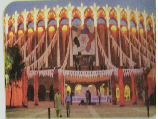
Alhamra Cultural Complex

The theatre sits in the midst of large green areas, at a stone's throw from Lahore's famous willow lined canal. Its imposing brick façade set with local regional features such as handmade Multani tiles is an interesting blend of the contemporary and the traditional classicism of the Roman coliseum. The multi-purpose theatre is designed to cater for drama, Music, cultural melas and large scale concerts.